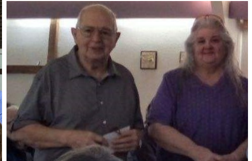
At left: Scenes from our every growing January potluck